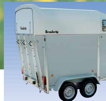
Prestige horse trailer, page 6