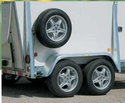
Accessories/extra equipment, page 9