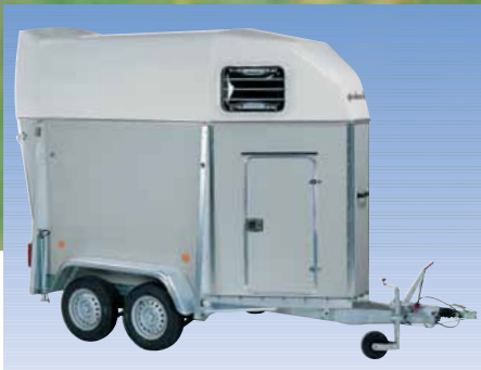
Solo horse trailer, page 8