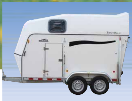
Baron horse trailer, page 4