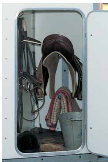
The Royal TC model features a built-in tack compartment with an interior light and holders for two saddles.