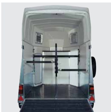
The partition wall can pivot and is easy to remove.