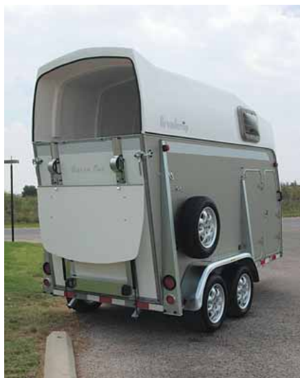
Available as HB or SL. Shown, saddle rack and seat in a one-horse trailer.