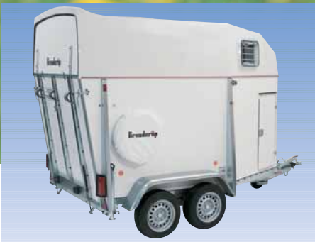
Royal horse trailer, page 7