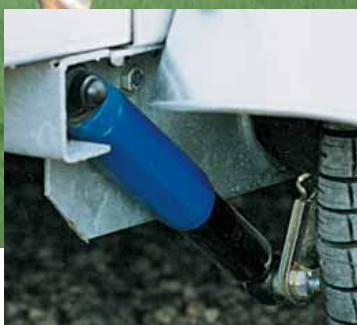
The special rubber torsion axles provide individual suspension on all four wheels – resulting in a smooth and comfortable ride.